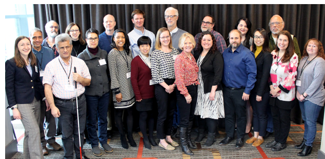
AccessCyberlearning 2.0 CBI attendees.

During the workshop four research questions were explored: (1) What challenges do learners with different types of disabilities face in using current and emerging digital learning tools and engaging in online learning activities? (2) How do current digital learning research and practices contribute to the marginalization of individuals with disabilities? (3) What advances in digital learning design are required to